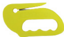
100 SCBC EZ-ON Safe Cut Belt Cutter

CUT ALONG DOTTED LINE FOR EMERGENCY RELEASE